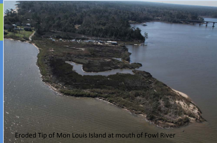
Eroded Tip of Mon Louis Island at mouth of Fowl River